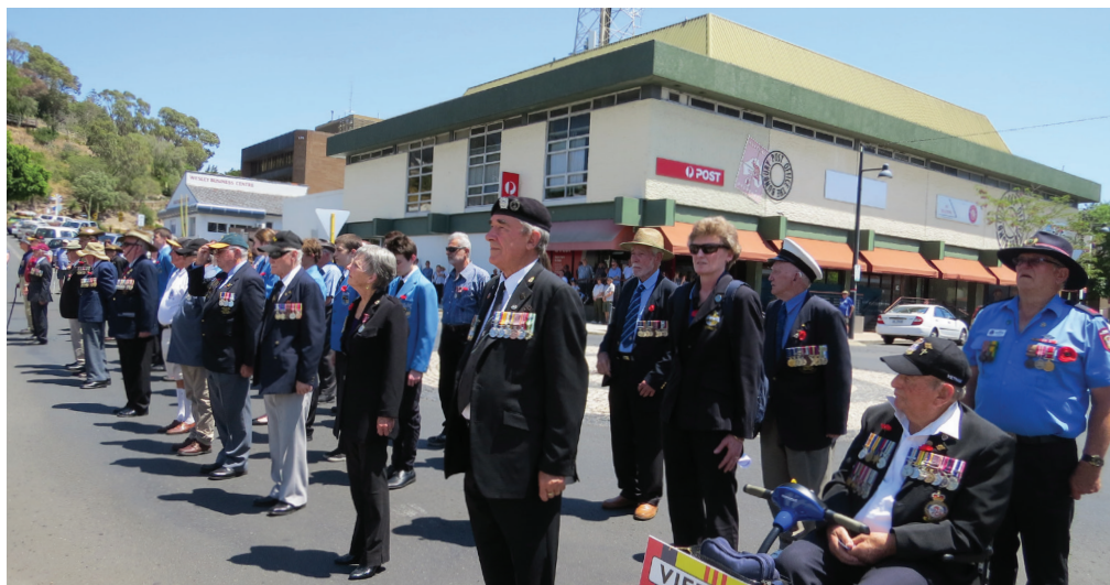
> Veterans on Parade, ANZAC Memorial Bunbury - Remembrance Day Service 2017