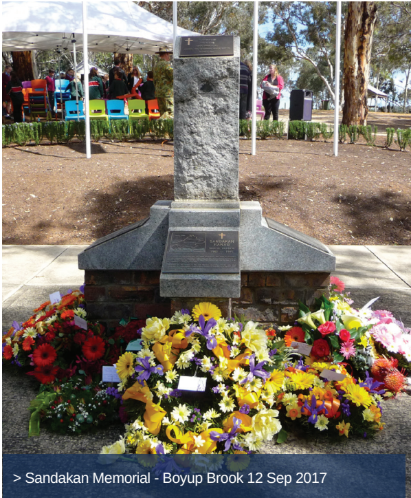
> Sandakan Memorial - Boyup Brook 12 Sep 2017