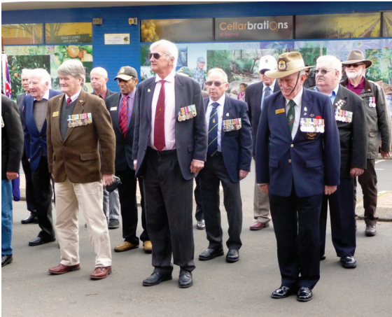
> 2017 Vietnam Veterans Day Commemoration - Harvey Memorial