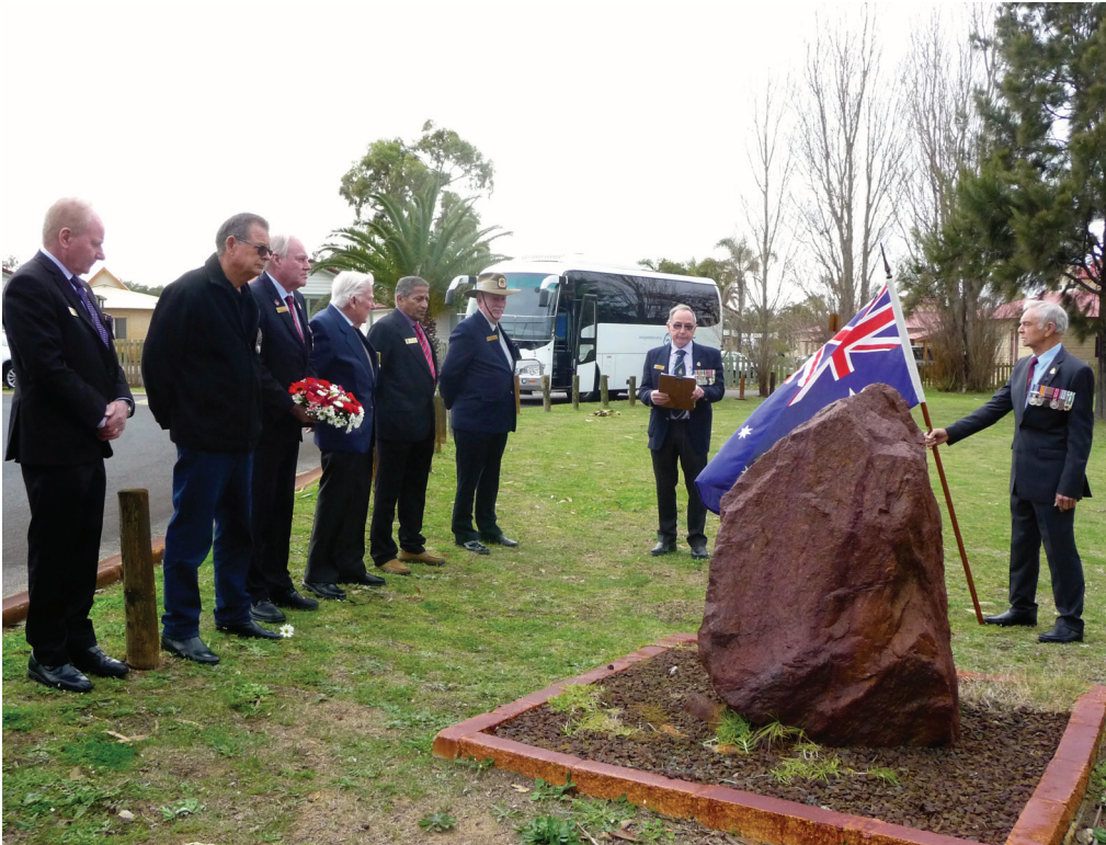
> 2017 Vietnam Veterans Day Commemoration - Sykes Memorial, Bunbury