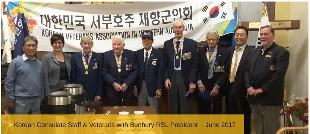
> Korean Consulate Staff & Veterans with Bunbury RSL President - June 2017