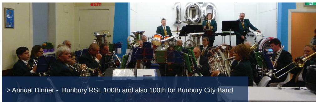
> Annual Dinner - Bunbury RSL 100th and also 100th for Bunbury City Band