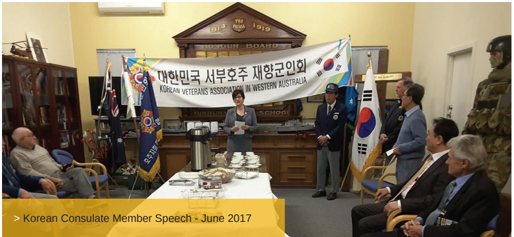
> Korean Consulate Member Speech - June 2017