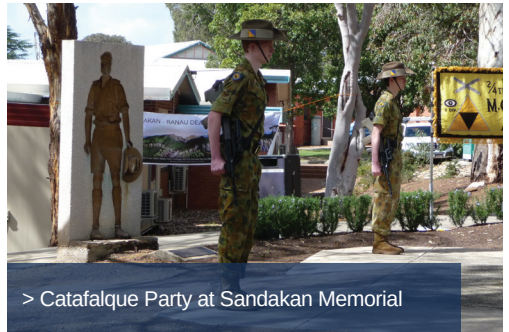
> Catafalque Party at Sandakan Memorial